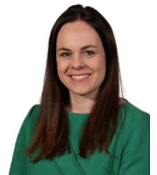
Kate Forbes MSP Deputy First Minister Scottish Government

Kate Forbes is the Member of the Scottish Parliament for the Skye, Lochaber and Badenoch constituency (which includes Dingwall, the Black Isle and the Great Glen). She is the Deputy First Minister and Cabinet Secretary for the Economy and Gaelic in the Scottish Government.