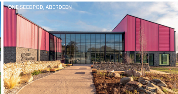
ONE SEEDPOD, ABERDEEN