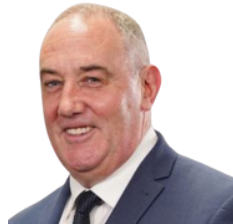
Paul McLennan MSP Minister for Housing Scottish Government

Paul McLennan is the MSP for East Lothian for past three years, first elected in the 2021 Scottish Parliament election. Prior to that Paul has 20 years of experience in the Financial Sector and 10 Years in the Public Sector in Leadership Positions.