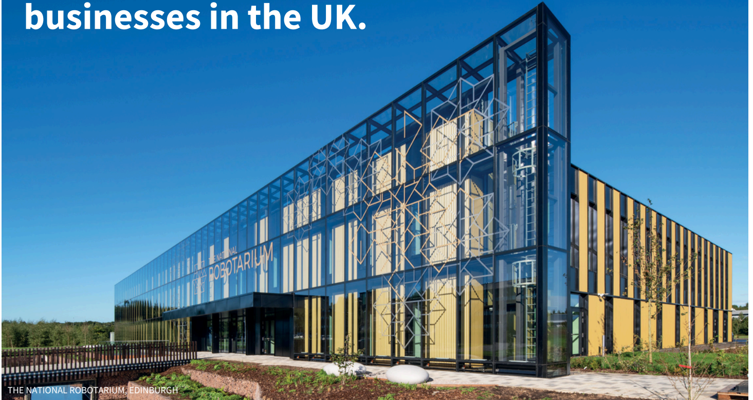
THE NATIONAL ROBOTARIUM, EDINBURGH

We're one of the largest family-owned property, construction, infrastructure and support service businesses in the UK.