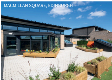
MACMILLAN SQUARE, EDINBURGH