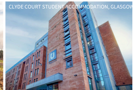
CLYDE COURT STUDENT ACCOMMODATION, GLASGOW

Through an approach that's fully collaborative and outcomes-focused and expertise in asset management, regeneration funding solutions, masterplanning and property development, we help the public and private sectors build better places and more sustainable buildings.