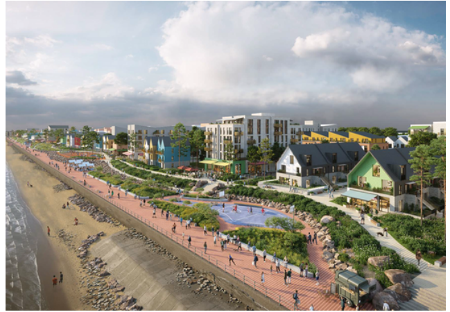
Seafield concept image

One of the most exciting opportunities currently emerging in Edinburgh is Seafield: around 40 hectares of waterfront land located between the award-winning neighbourhood of Leith and Portobello.