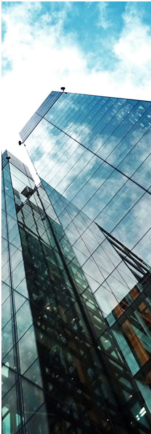
Table of Contents & Info