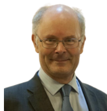
Sir John Curtice University of Strathclyde

Sir John Curtice is a professor of politics at the University of Strathclyde, president of the British Polling Council and senior research fellow at both the National Centre for Social Research and UK in a Changing Europe. He is one of the UK's best known political scientists and has frequently appeared on BBC News during broadcast coverage of general elections in the United Kingdom. He has a career spanning over 45 years and has worked on 11 general elections.