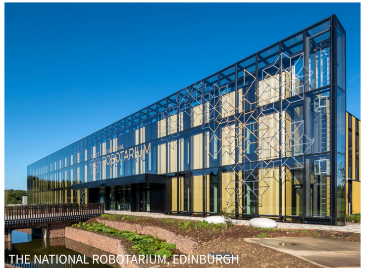
THE NATIONAL ROBOTARIUM, EDINBURGH