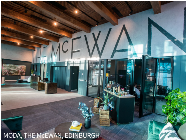
MODA, THE MCEWAN, EDINBURGH