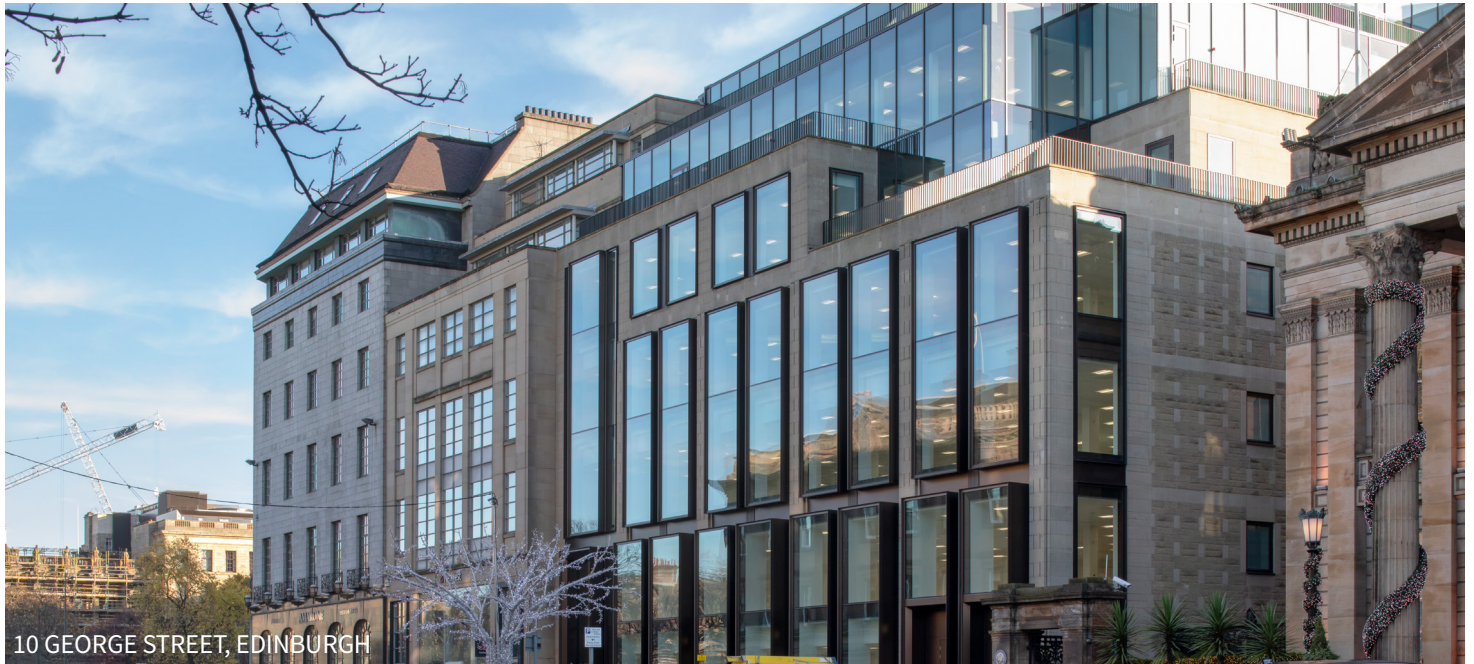
10 GEORGE STREET, EDINBURGH